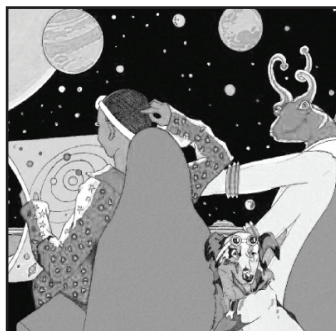
Then, after that...